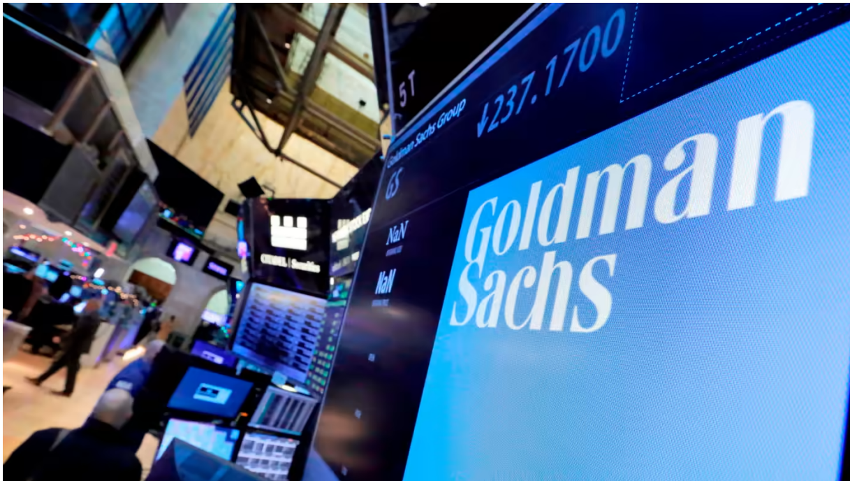
The Goldman Sachs logo on the floor of the New York Stock Exchange

A senior female banker's memoir makes for uncomfortable reading for boosters of the banking behemoth